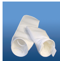
Complete line of bag filter media