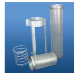
Stainless steel basket, spring and leg assembly